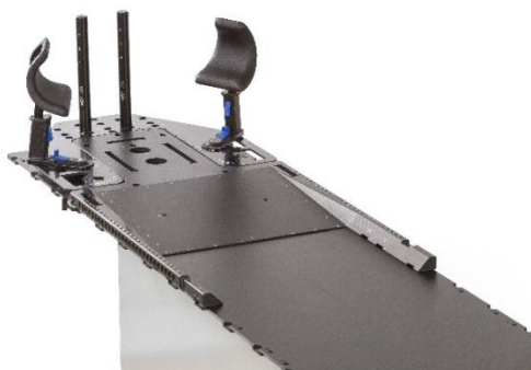
Figure 1: Adjustable Arm Supports on Short SBRT Base Plate

Figure 1 illustrates how the Adjustable Arm Supports are mounted on the ARM REST SUPPORT PLATE (Art. No. 32317/15) that is attached to the SHORT SBRT BASE PLATE (Art. No. 32317/14).