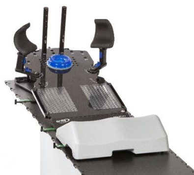
Figure 2: Adjustable Arm Supports on MammoRx® Breast Board

The Adjustable Arm Supports can also be indexed on the MammoRx® Breast Board (Figure 2).