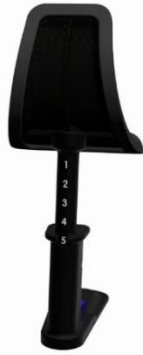
Figure 5: Indexing positions on Adjustable Arm Support