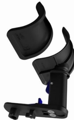
Figure 6: Removable cushion of Adjustable Arm Support

Take off the cushion to have access to the entire arm pad, and to be able to clean the cushion on the inside.