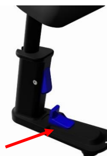
Figure 3: Bottom trigger of Adjustable Arm Support

To mount the Adjustable Arm Support on the SBRT Base Plate or MammoRx Breast Board, pull the bottom blue trigger (see Figure 3) and insert the post with its two tabs into the desired hole. The arrow on the base plate should be pointing towards the line on the support. Then rotate it downwards to the desired position. The Adjustable Arm Supports can be rotated to one of four indexed positions that are marked R1-R4, L1-L4, RA-RD, LA-LD. To remove the support, pull the blue trigger and rotate the Adjustable Arm Support past the R4, RD, L4 or LD position until it stops at the arrow and lift it out of the mounting hole.